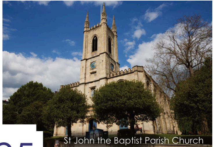
St John the Baptist Parish Church