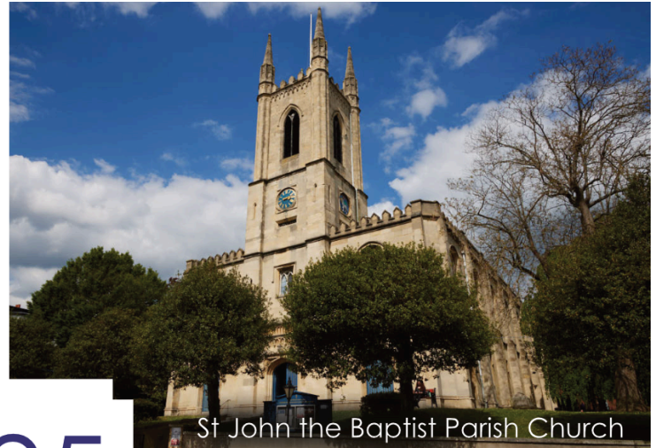
St John the Baptist Parish Church