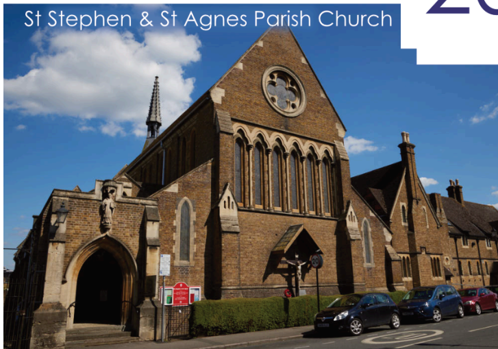
St Stephen & St Agnes Parish Church