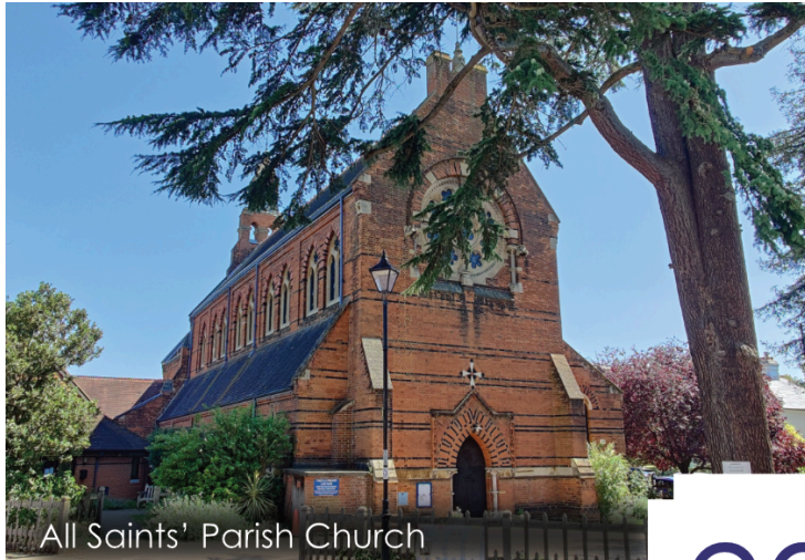
All Saints' Parish Church